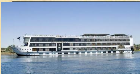
4 Day Nile cruise to Nubia

Price includes taxes and fuel surcharges.